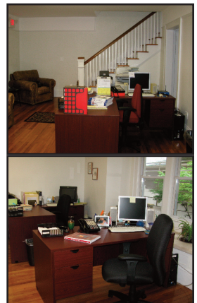
This is what our old office looked like when we first moved in ten years ago. It's crazy - so much has changed!