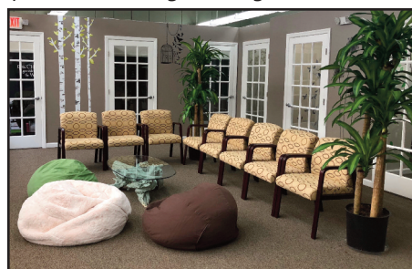
Our tutoring center reception area and individual tutoring rooms.