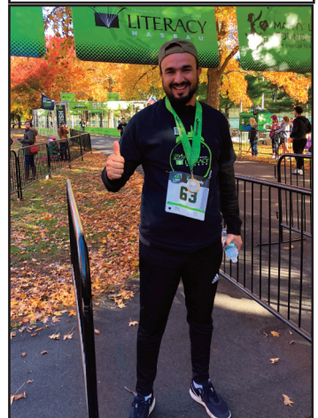
One of our Freeport ONA students completes the race.