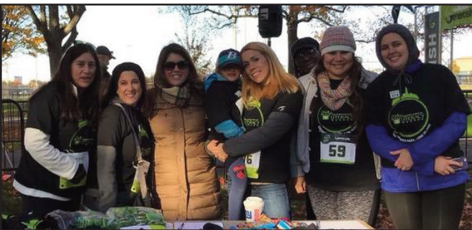
Literacy Nassau staff all ready to run/walk the Dyslexia Dash.